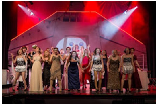
Chepstow Musical Show Choir