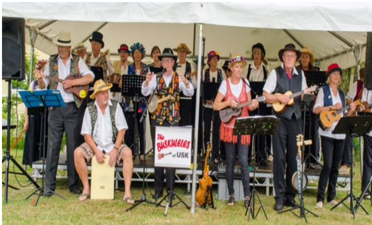
Fabulous Usk Buskuleles