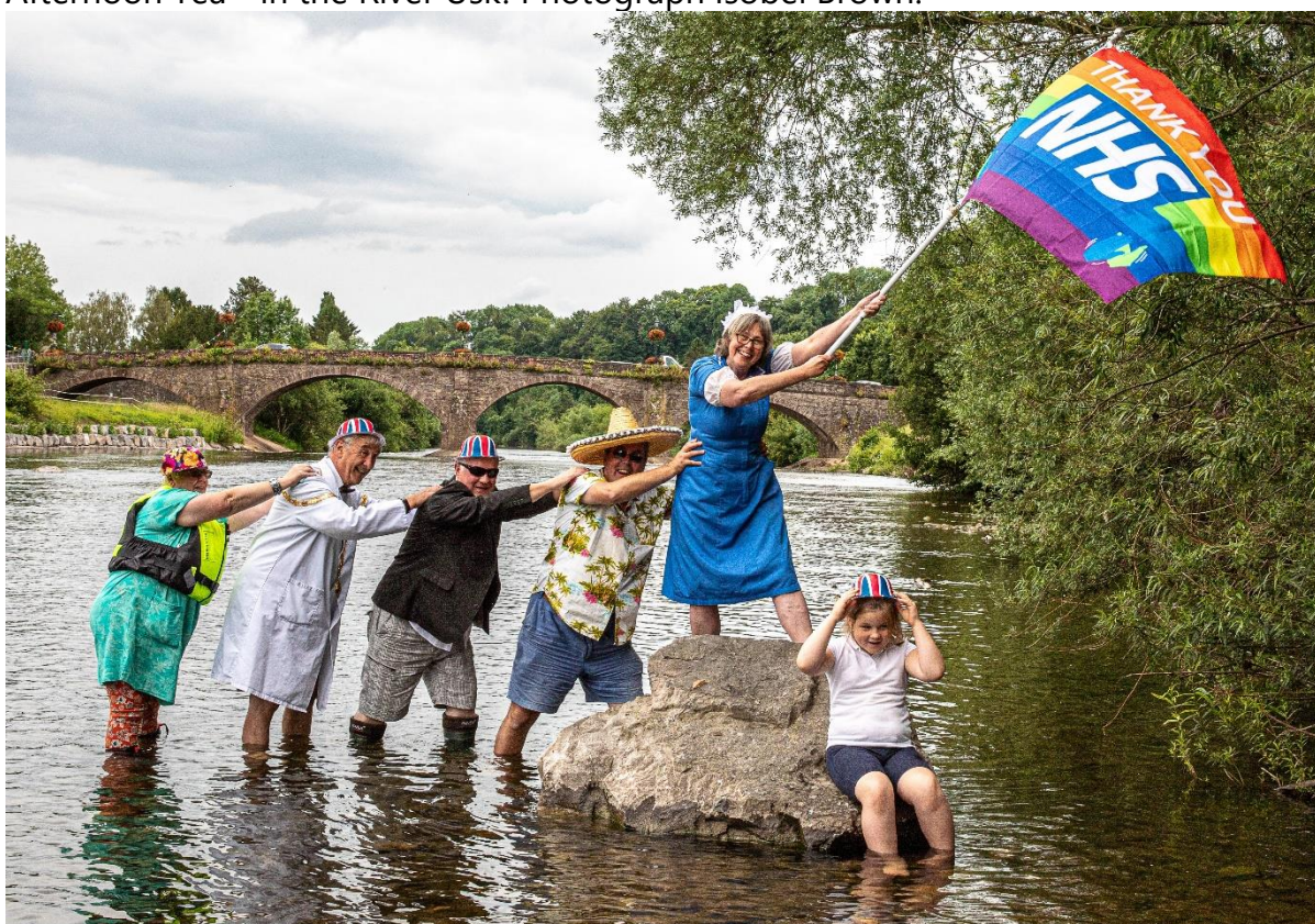
Raising the NHS Flag for our Heroes!