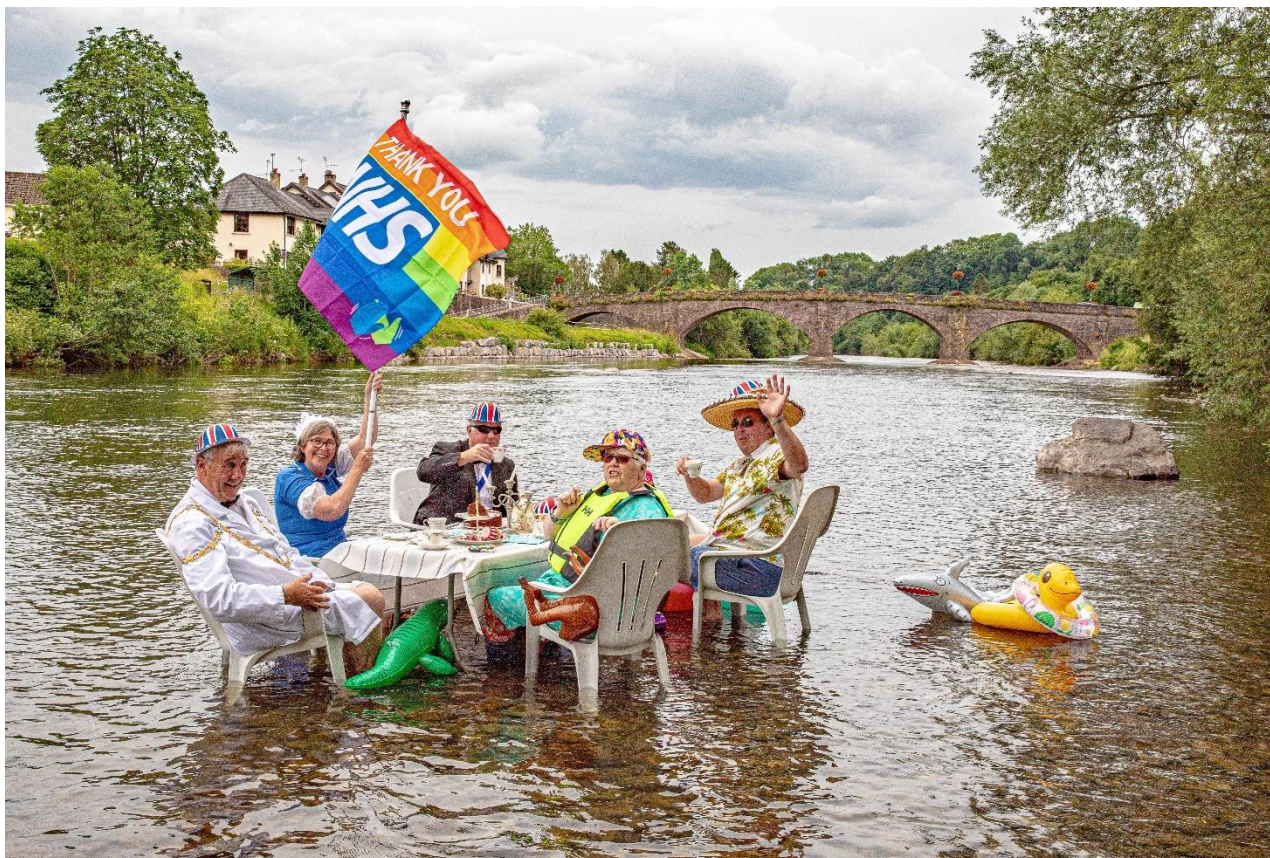
Clotted Cream in the Stream! Usk's entry to the £1,000 prize for the wackiest location for Afternoon Tea - in the River Usk!